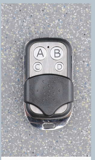
Compact remote control (dimensions: 55 x 30 mm)