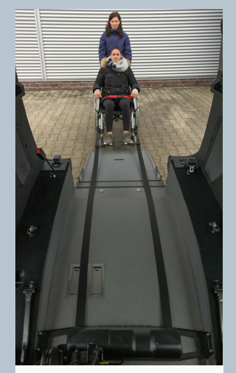
Automatic winch for the wheelchair with occupant