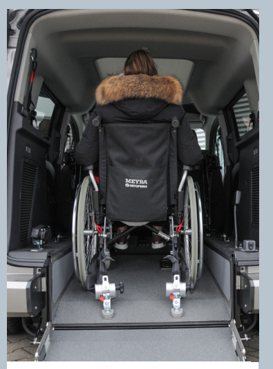
Securing wheelchair by retractors (back)